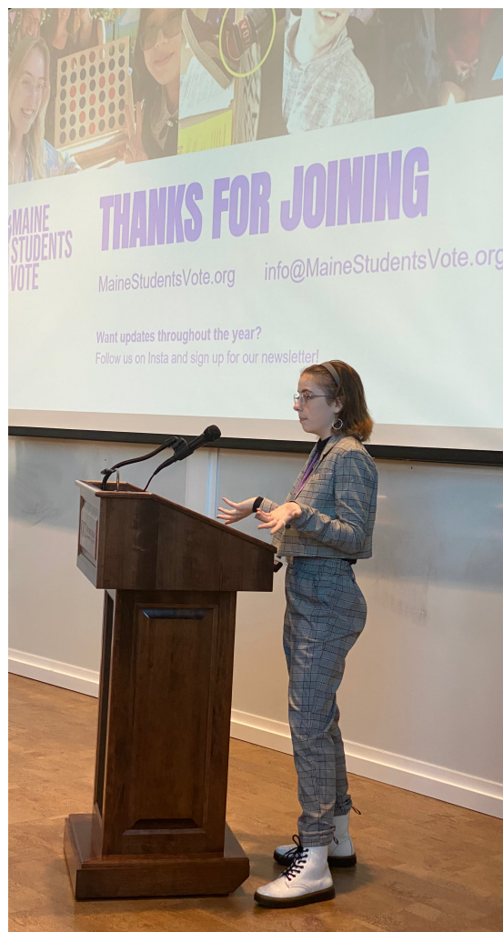
MSV fellow presents at the first in-person Maine Youth Voting Summit.

I can not vote. I am 17. And I am an immigrant, this system is not meant to work for me. I can not vote but maybe I can help other people who feel powerless make a difference.” — High School Intern 2022