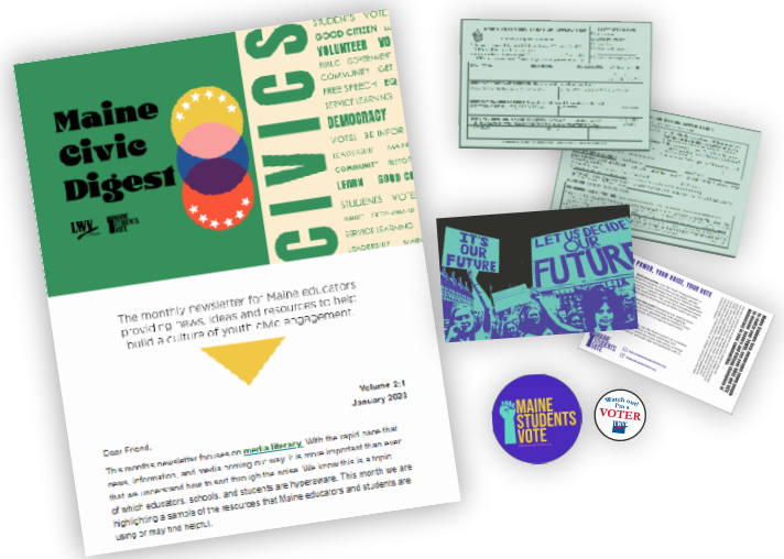
Left: The Jan. 2023 edition of the Maine Civic Digest newsletter.

Through developing a monthly newsletter for high school educators, called the Maine Civic Digest, we have built a network of 173 educators that span 120 schools . Through this newsletter, we have piloted new resources, like our First Time Voter Kits, and uplifted the work of educators across the state.